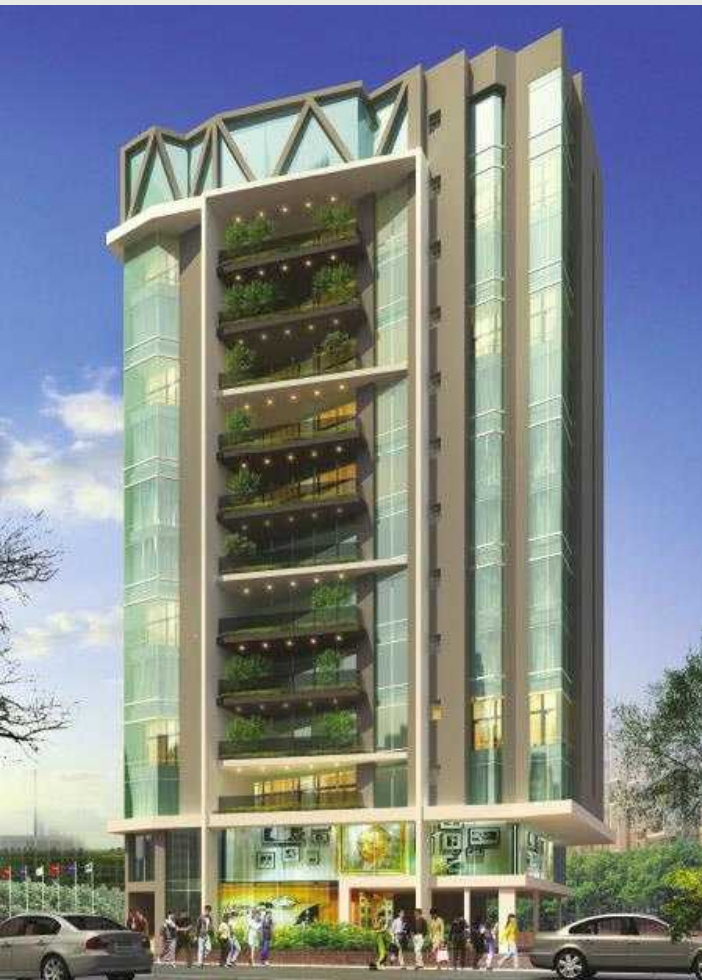
Gurukul Grandeur Hazra Road, Kolkata