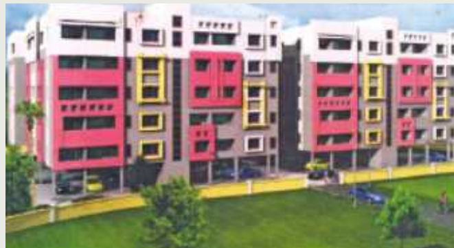
Panchawati Residency Barbil, Odisha