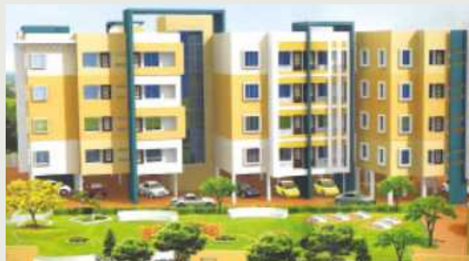
Pearl Heights Rourkela