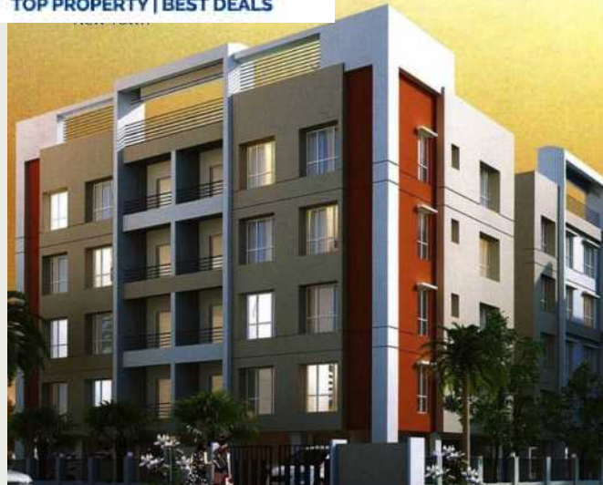
Gurukul Grande New Town, Kolkata (Phase I, II, III, IV)