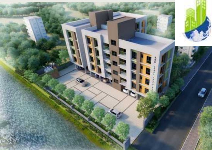
Gurukul Lakeview Canal Road, Kolkata